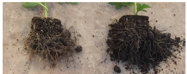
An untreated plant after 5 weeks versus a plant treated with PHC's cultivation programme after 3 weeks.

We advise you to have a mycorrhizal analysis carried out before using any of the above products. Arrange for another analysis to be performed at the end of the season. The PHC laboratory is specialised in performing mycorrhiza analysis for all crops. Contact info@phc.eu for a sampling kit.