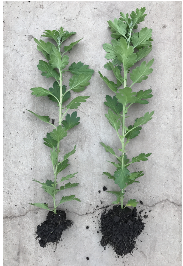
Firmenich (3 weeks) untreated vs treated.

For questions or advice, please send an e-mail to info@phc.eu